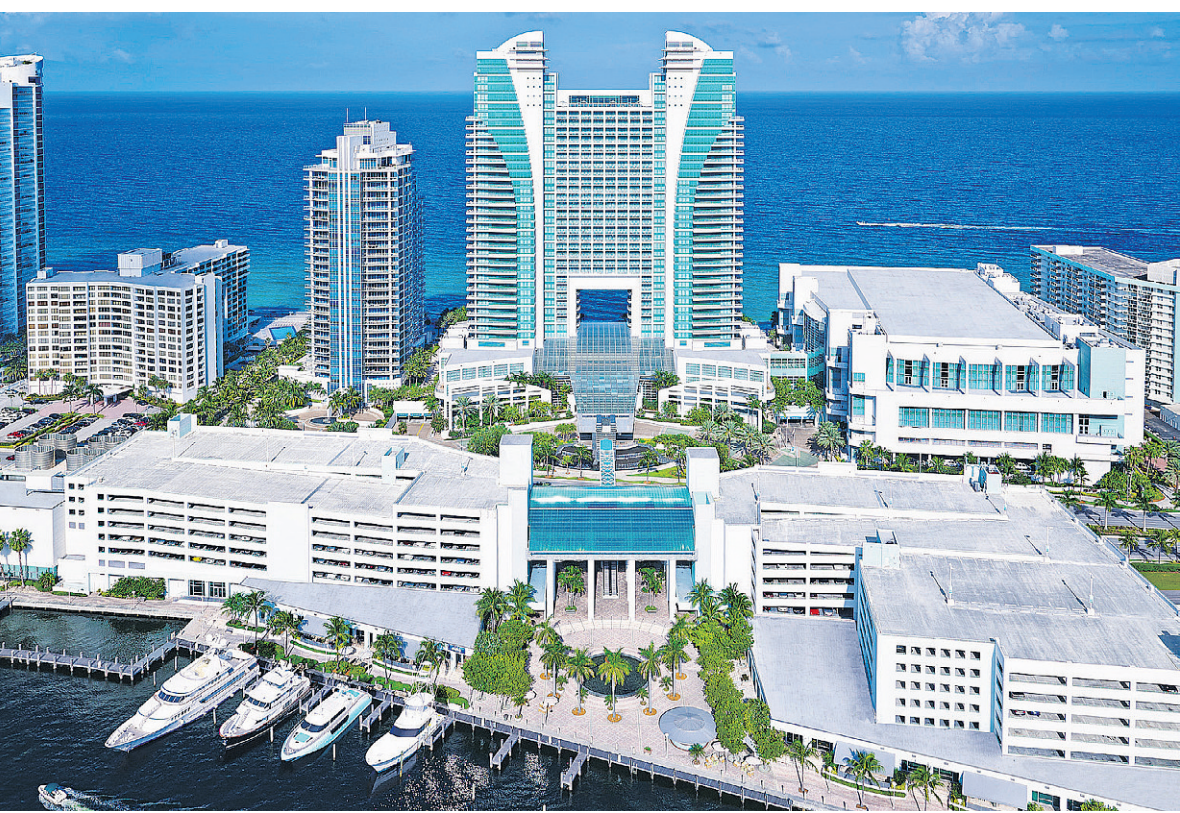
The Diplomat Beach Resort has added new family features as part of its update. THE DIPLOMAT BEACH RESORT

The Kids' Club (ages four to 12) organizes Kitchen Chem-