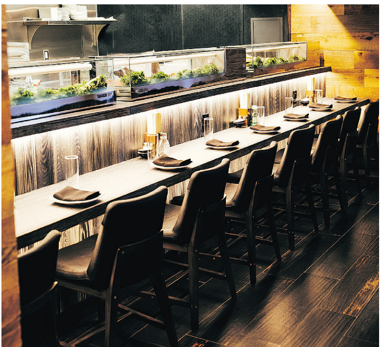
Monkitail at The Diplomat serves modern izakaya Japanese cuisine.

ists, Epic Explorers, Secret Agent and Art sessions.